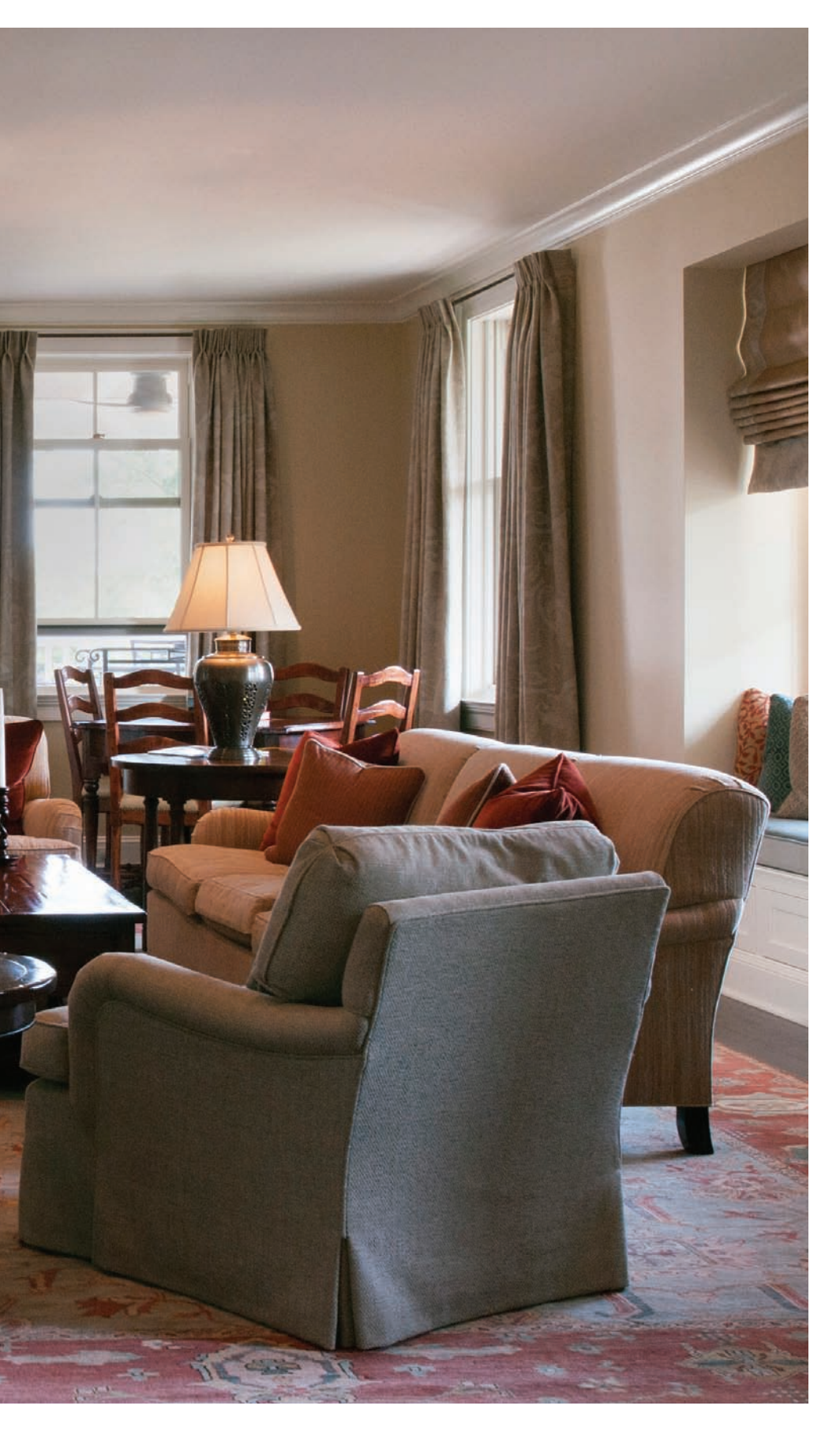
Warm reds, crisp blues and soothing neutrals make up the color palette in this comfortable family room. A rich mix of texture and finishes was used in the design of the family room.

porch allows the homeowners to take full advantage of the 270 degree views of the surrounding landscape and provides "easy flow" to the outdoor living spaces. Working with the foundation and fireplace of the original 3,800 square foot building, "the new home includes six bedrooms, a children's study/art room and an office on the second floor". The original four car garage was "repurposed into an exercise room and pool cabana for the new pool". In addition to the new 8,100 square foot home, the property also includes an observation tower, separate garage/barn, orchard and vegetable garden.