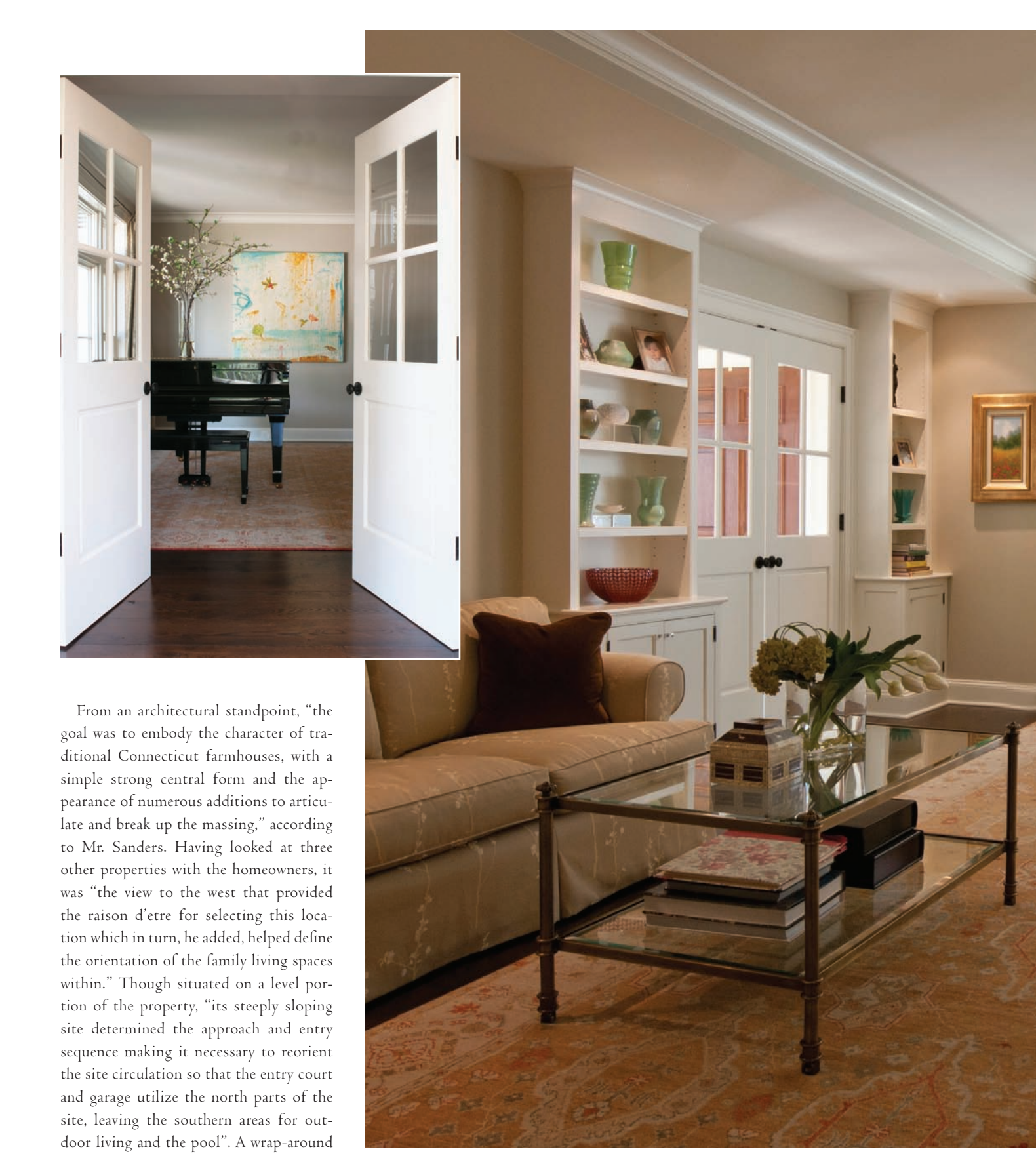
A beautiful grand piano makes a statement in the formal living room. Sophisticated, yet unpretentious, the home's interiors had to be both child and canine friendly for this family of six and their beloved dog, Buca.