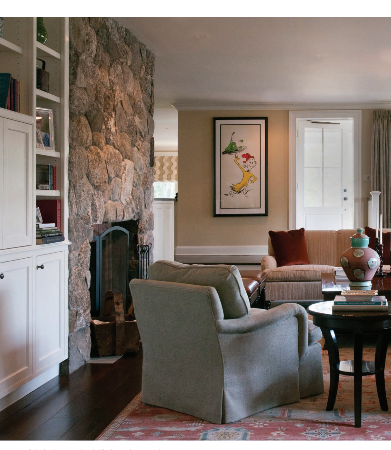
In the family room, a whimsical Dr. Suess print sums up the family's attitude towards life best; "keep things fun and light".