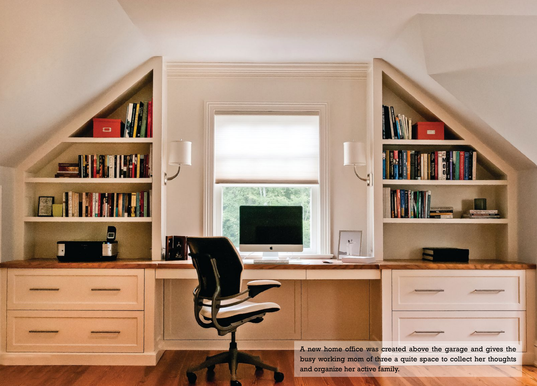
A new home office was created above the garage and gives the busy working mom of three a quiet space to collect her thoughts and organize her active family.