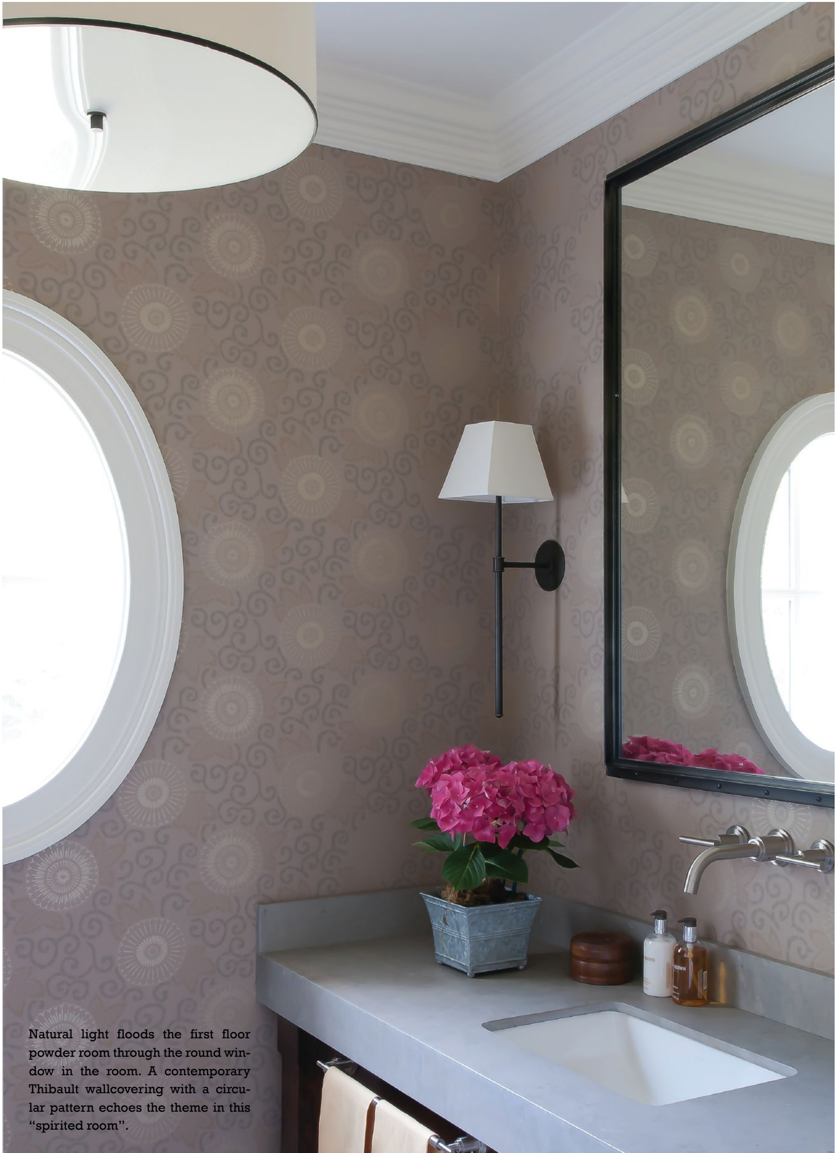
Natural light floods the first floor powder room through the round window in the room. A contemporary Thibault wallcovering with a circular pattern echoes the theme in this “spirited room”.