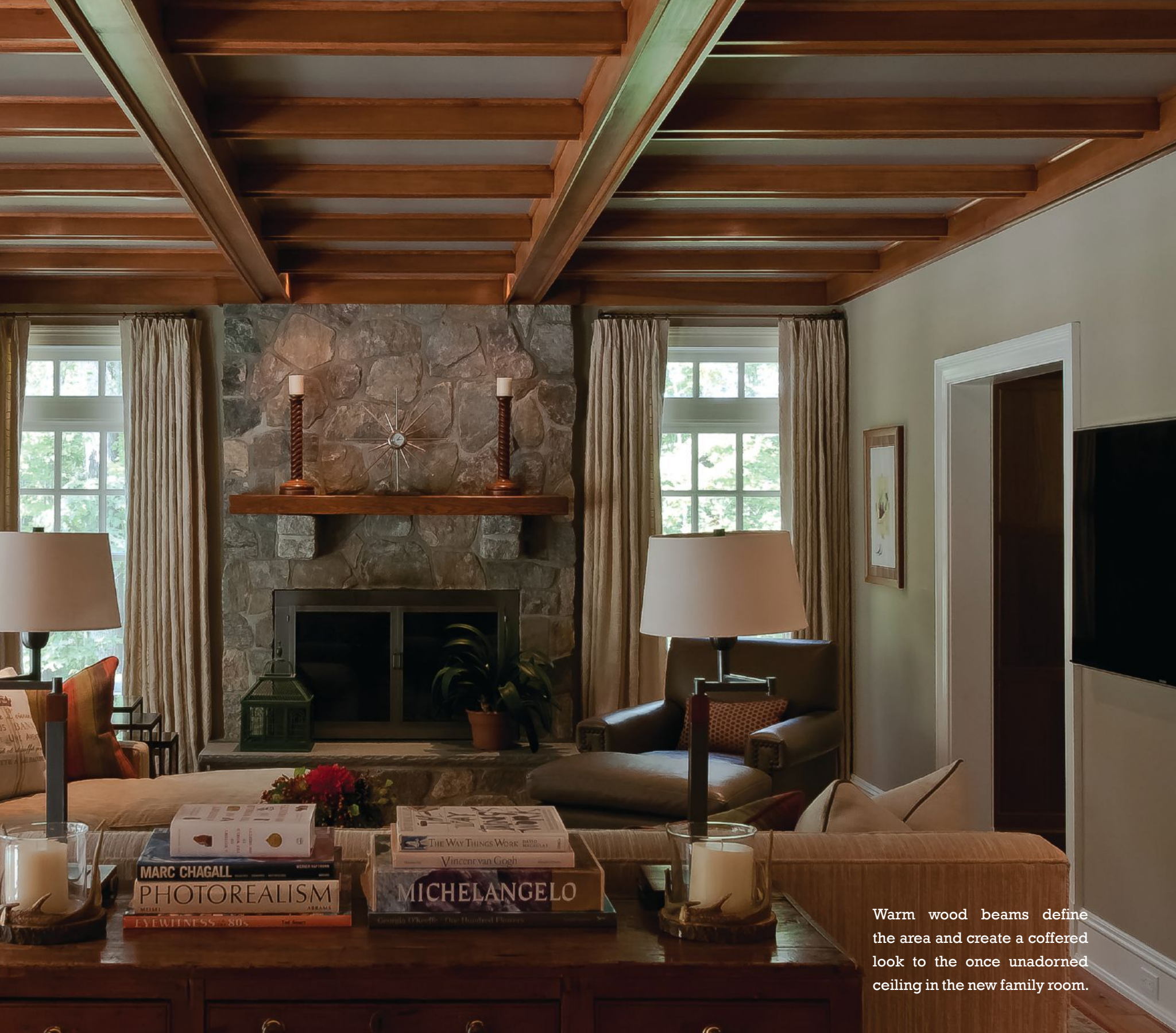
Warm wood beams define the area and create a coffered look to the once unadorned ceiling in the new family room.

faced, was addressing the proportions of the combined kitchen, breakfast and family room space.” At fifteen feet wide and fifty-five feet long, it lacked the architectural interest and gracious detailing that define the vast body of Ms. McGarry’s work. To accomplish this feat, she introduced a dividing wall between the kitchen and family room areas. A cased opening was created to maintain open “communication” between the spaces. McGarry worked in conjunction with Norwalk builder, R.J. Aley to transform the spaces.